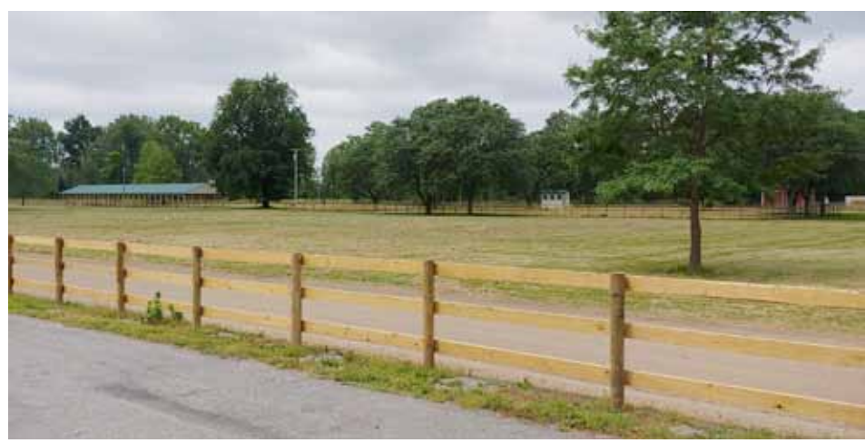
Avon Driving Park